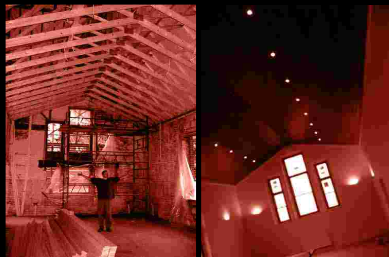
The new dts classroom during and after renovation.

twin en-suite rooms. Having an additional facility would enable us to run more courses including second level schools as well as provide a conference centre for other YWAM teams and the local church to use.