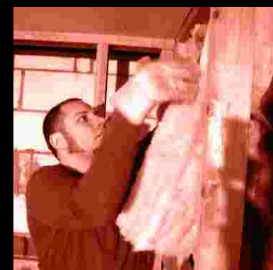
Volunteers working in the basement of the Coach House

Throughout the long and often frustrating process of seeing this project through, God has been steadily at work not only in building structures but our faith in His character as well. Hold ups and complications have certainly been a part of the journey; and in the interim of waiting for the vision to become a reality, He's used those things to remind us of how perseverance and faithfulness on our part builds the Godly character He wants us to have. We've learned to hold onto the prophecies and dreams God has given over the years and to move forward in faith, making Holmsted Manor all that He desires it to be.