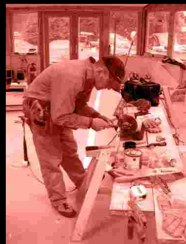
Volunteer working on twin en-suite room.

Building people is an integral part of how God builds community. Each person who's participated in seeing this work accomplished from long term workers to DTS work duty students and even those mission builders and individuals coming for just a week or two have made an investment in the community life of Holmsted Manor. As God works in us, He challenges us to serve and influence one another as we live out our mission, which is to be a radical, relevant and transformational community. As we take on His heart for one another, we become more equipped to fulfil our mission to train people and develop missions' projects both locally and globally.